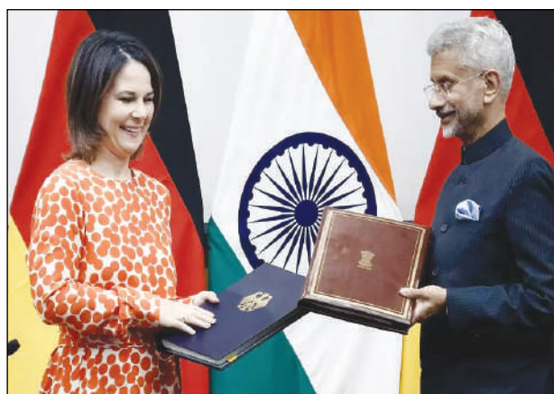
Annalena Baerbock, German Foreign Minister, and Subrahmanyam Jaishankar, Foreign Minister of India

"I am confident that the Comprehensive Migration and Mobility Partnership Agreement